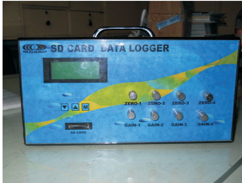
Bench Top Model