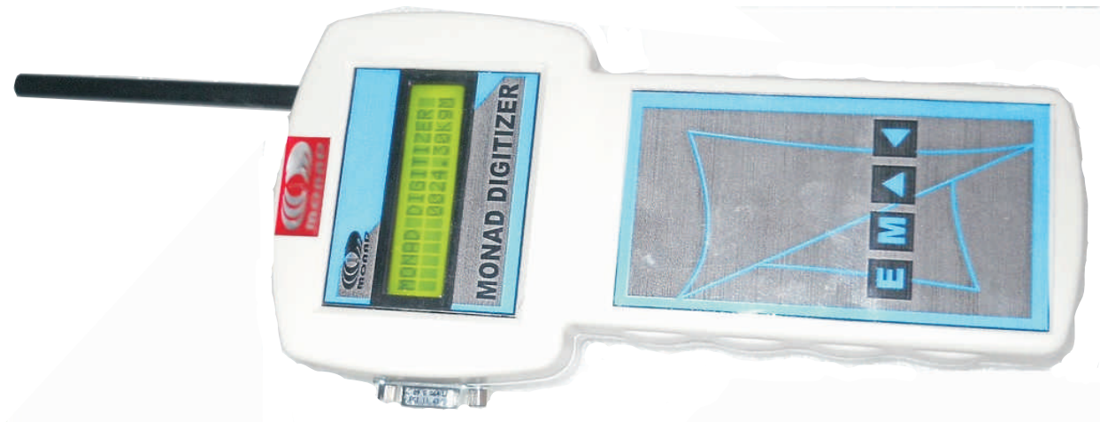
Hand Held Model